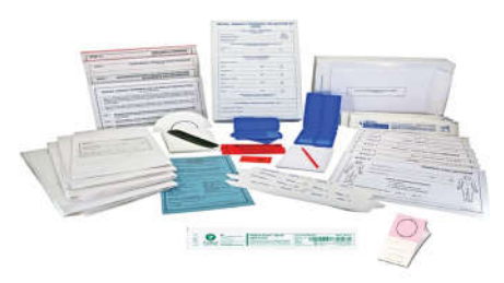
Evidence Collection Kit

Blessing-Rieman offers two forensic nursing classes. They are Intro to Forensic Nursing (Nsg 282) and Forensic Nursing (Nsg 497). Both classes are online courses. The Intro to Forensic Nursing class is geared to those who have had very little experience with nursing