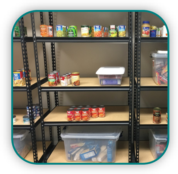
Location: Student Services Building 2 North (lower level)