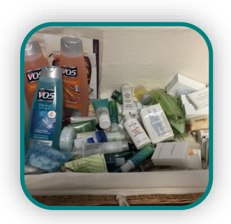
Hours: Monday - Friday 8am - 5pm and by appointment

The purpose of the Caring Cupboard is to alleviate insecurities on the College campus by providing food and basic hygiene items to our current College community.